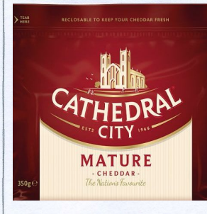
26 L u r p a k 27 P e r s i l 28 T e t l e y 29 H e i n z 30 C a t h e d r a l