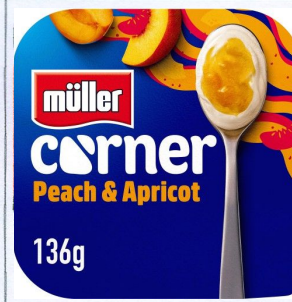
21 P G T i p s 22 W e e t a b i x 23 W a r b u r t o n s 24 S c h w e p p e s 25 M u l l e r