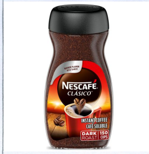
16 A n d r e x 17 C o c a C o l a 18 J o h n W e s t 19 M a l t e s e r s 20 N e s c a f e