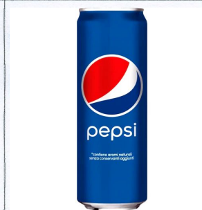
1 f i n i s h 2 C a d b u r y 3 L u c o z a 4 M r K i p l i n g 5 p e p s i