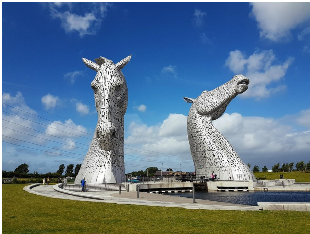
The Kelpies, Falkirk

Please note: Edinburgh and Glasgow are built on hills – lots of walking!